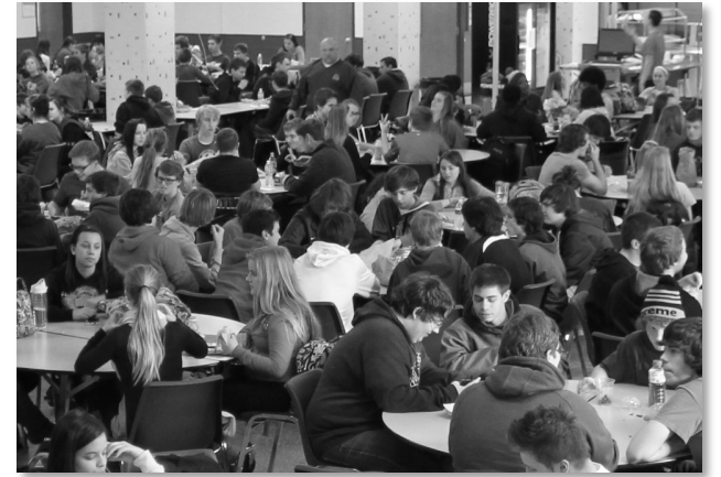
LHS students fill the cafeteria (pictured), commons and hallways for three lunch shifts each day.