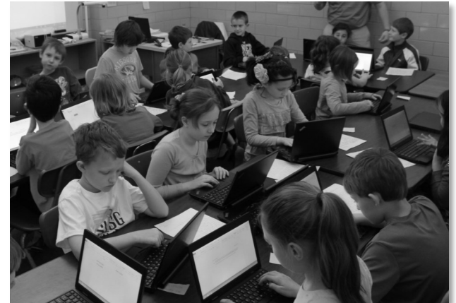
At Kennerly Elementary, Instructional Technology students fill every chair in a crowded section behind the gym.

Four of our five elementary schools are currently operating above capacity. In fact, there are enough elementary students currently enrolled to fill a sixth building.