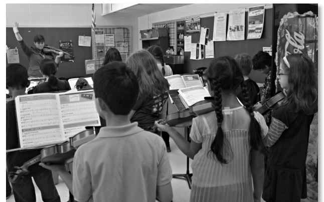
At Crestwood Elementary, the only available space for students to practice their talents is in the staff lounge.