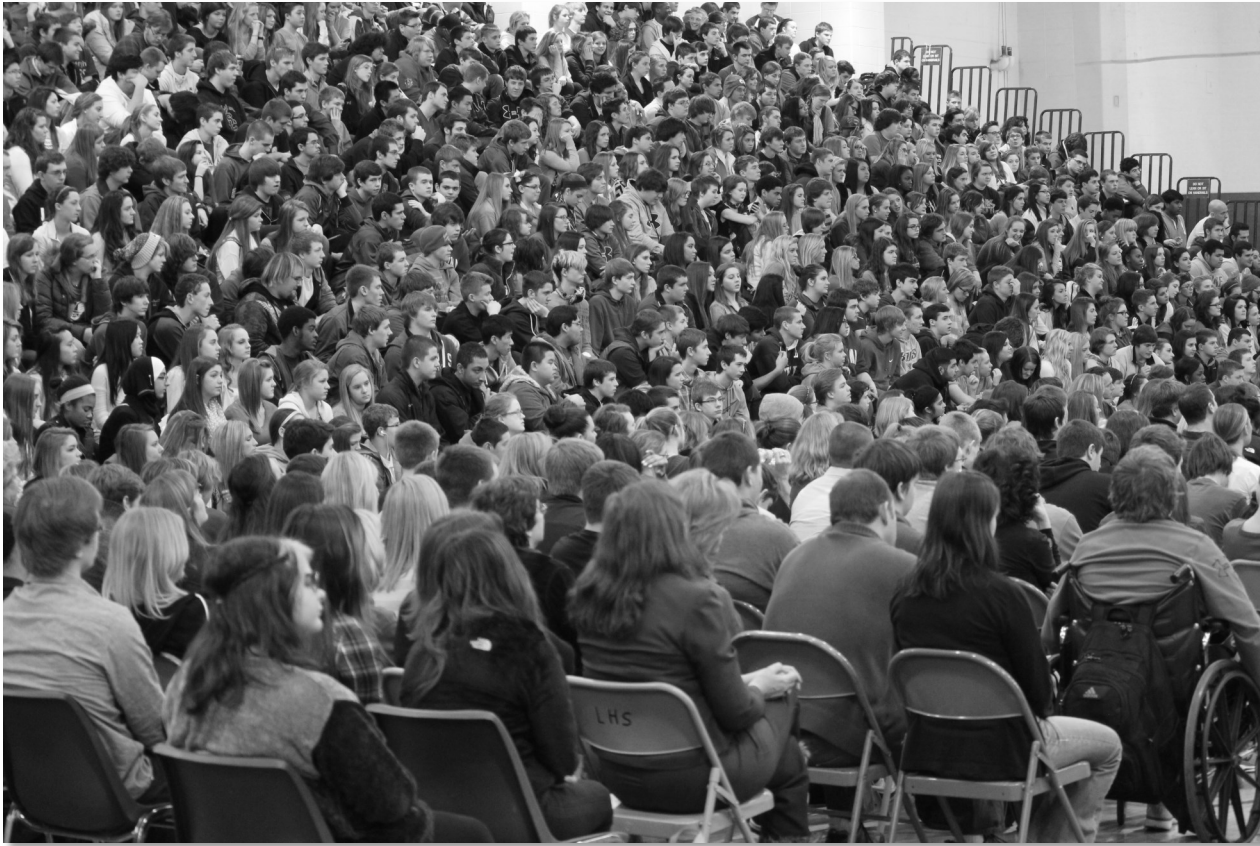
Students pack Gym 3 at Lindbergh High School during a recent all-school assembly, overflowing off the bleachers and on to the floor. The bleachers and floors in Gym 3 have not been updated since the facility opened in 1967. Prop G will make several improvements at LHS, including new bleachers and floors in Gym 3.